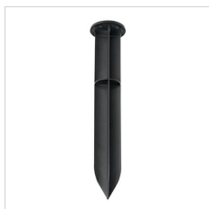
700191 Ground spike